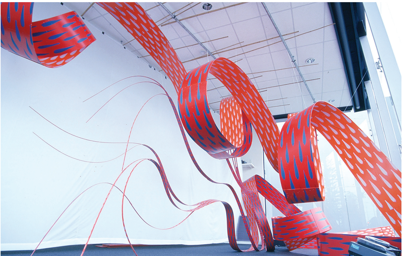
Caroline Graley & John Noordennen, Full Bloom

FAC invite visual artists to express their interest to exhibit in the Glass Cube Gallery at Cube 37. A high exposure and unique street front public art space that is viewed day and night. Submissions can be interactive or large scale sculptural installations which can be lit up or incorporate projections at night let your imagination run wild – the sky's the limit! Original, engaging and visual art installations are what we are looking for. So if you are feeling inspired, pitch us your idea.