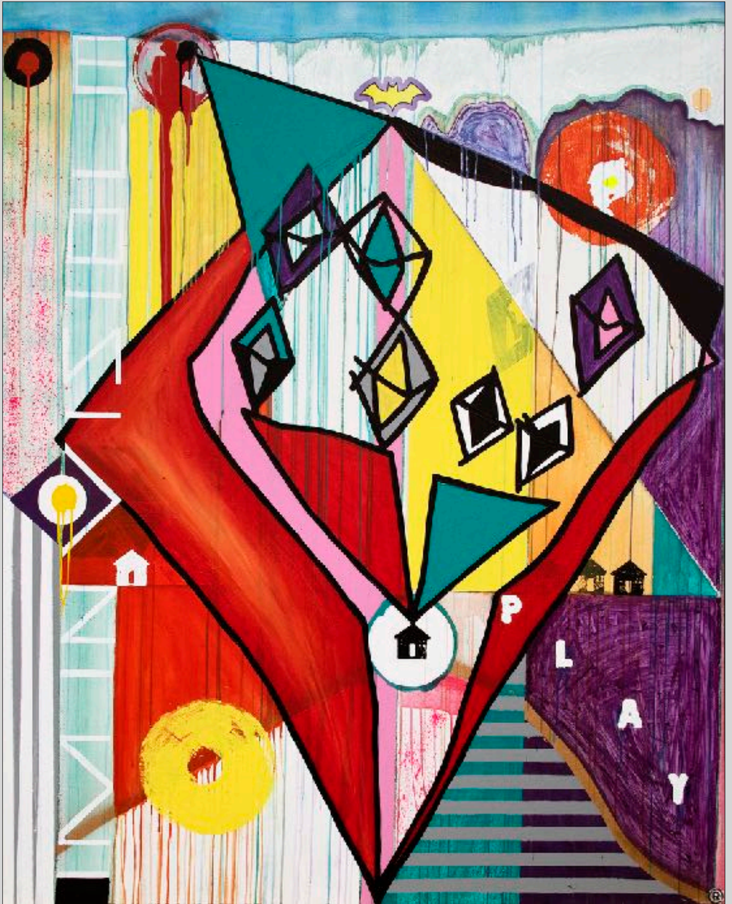
Flying Acrylic, oil stick, spray paint, charcoal and collage on canvas 175cm x 140cm, 2021 $6200