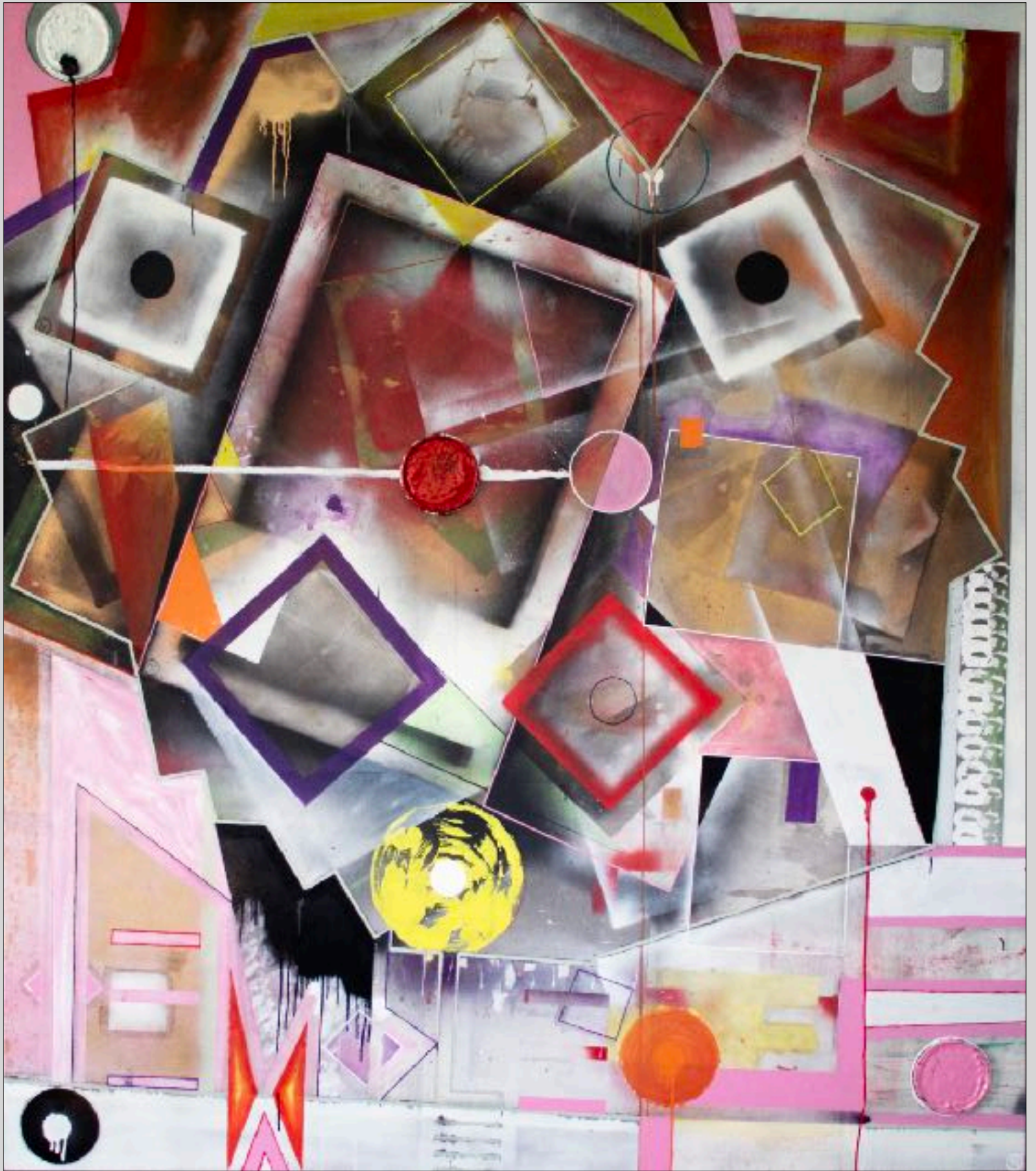
Let's Dance Acrylic, spray enamel, oil stick, charcoal, paint tin lids, and collage on canvas 200cm x 175cm, 2022 - 2024 $9500