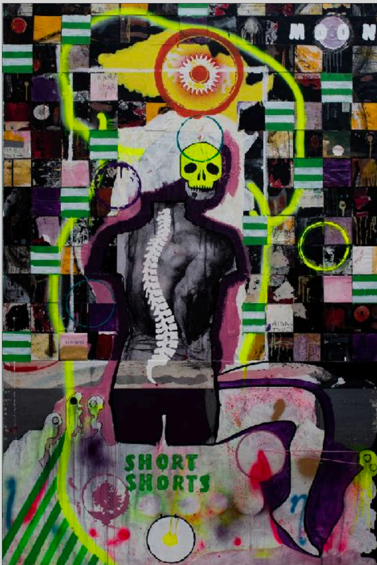
Selektor (Sun vs Moon), Acrylic, spray paint, oil stick, copic marker, charcoal and collage on canvas 200cm x 134cm. 2014 - 2023 $6800