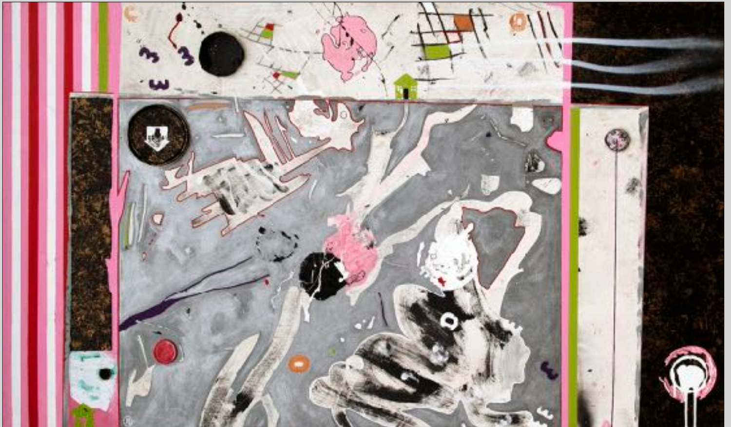
House of Change Acrylic, spray paint, oil stick, charcoal, paint skins, paint tin lids and collage on canvas 115cm x 195cm, 2017 - 2021 $4900