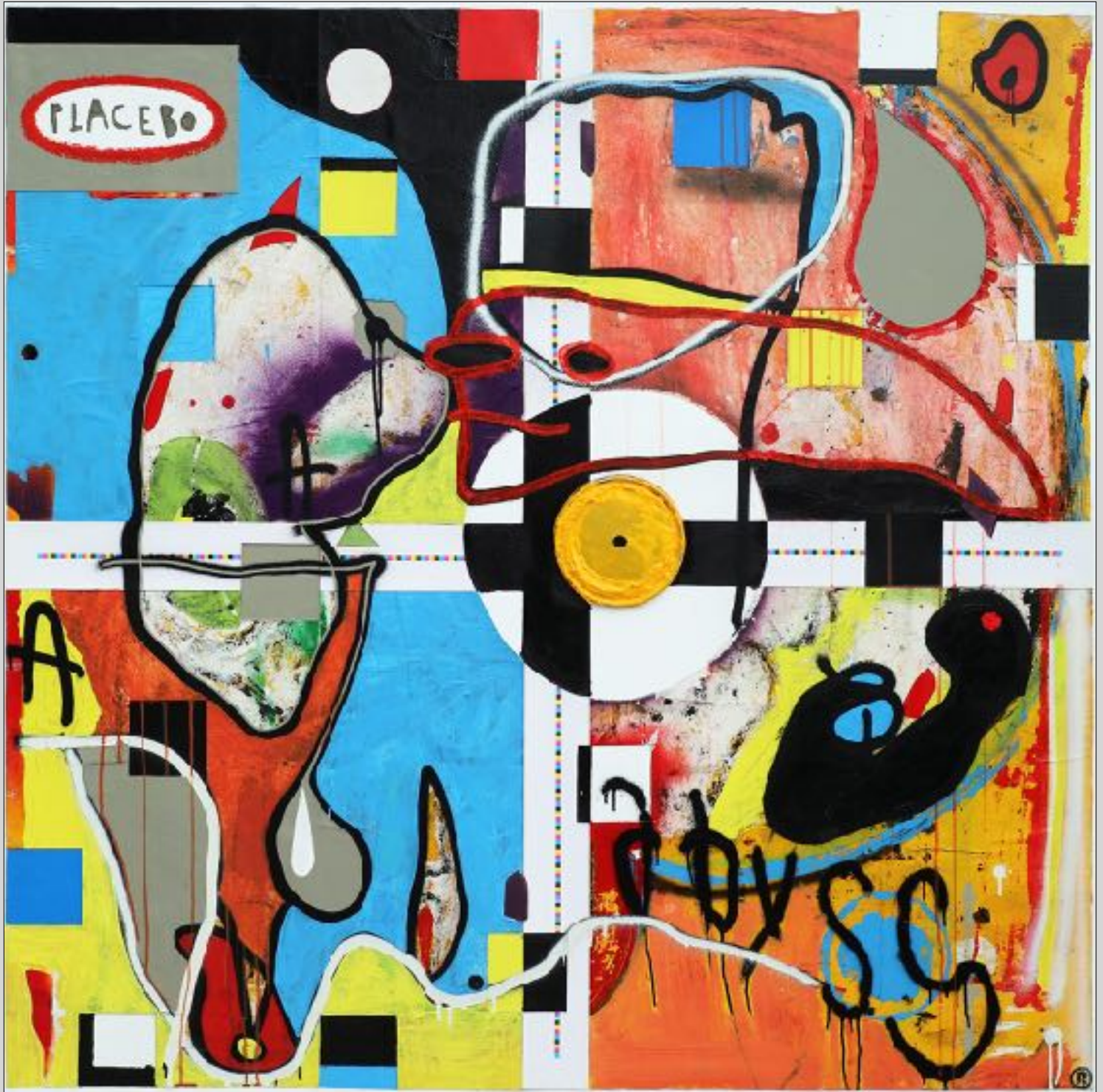
Abyss Acrylic, spray paint, oil stick, charcoal, collage and paint lid on canvas 140cm x 140cm, 2008 - 2021 $4700