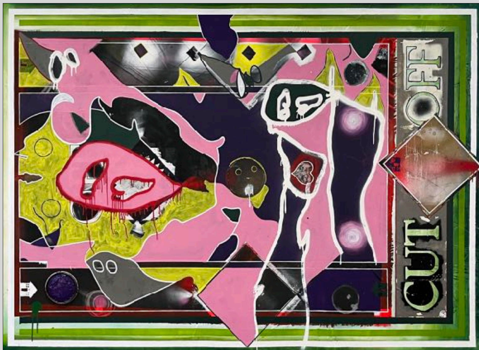
Let's Dance Acrylic, spray paint, oil stick, paint tin lid, and collage on canvas, 145cm x 200cm, 2024 $7700