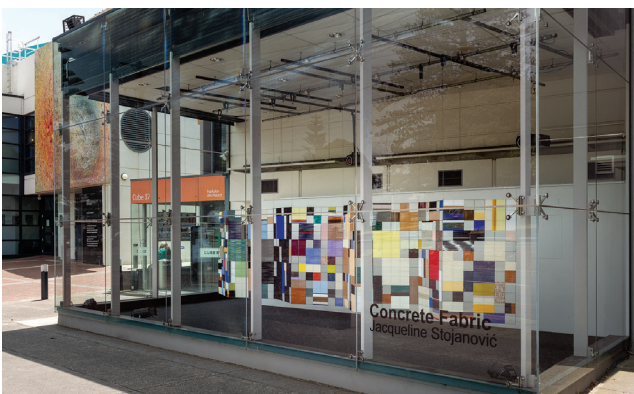
Jacqueline Stojanović, Concrete Fabric .