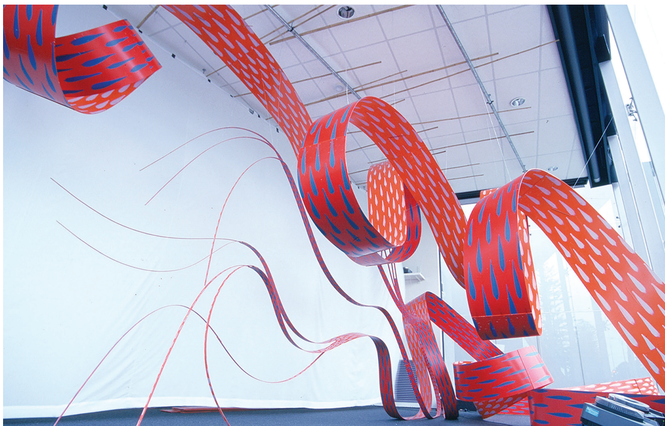
Caroline Graley & John Noordennen, Full Bloom

FAC invite creative practitioners to express their interest to exhibit in the high exposure and incredibly versatile street front space of Cube 37 Glass Cube Gallery. Submissions can be interactive, large scale sculptural installations, digital art projected onto its purpose built façade in Art After Dark, design furniture or a pop up shop selling quirky stuff; let your imagination run wild – the sky's the limit! Original, engaging and unique installations are what we are looking for. So if you are feeling inspired, pitch us your idea.