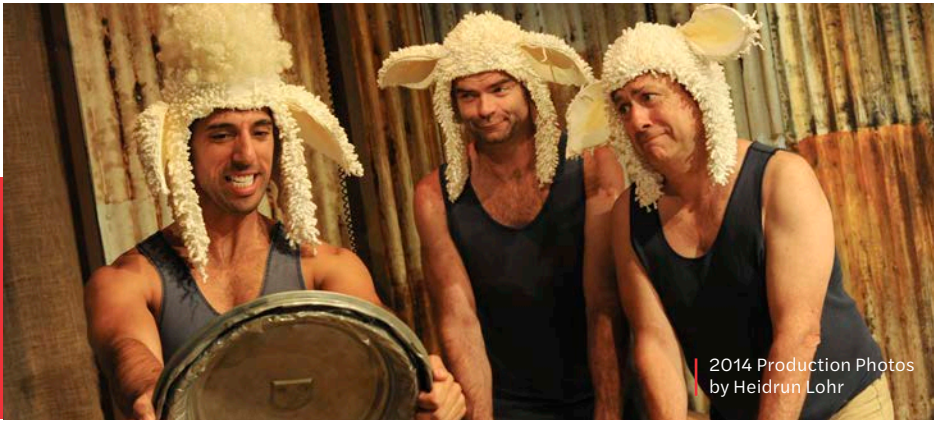
2014 Production