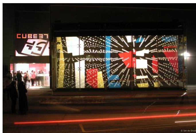
Art After Dark