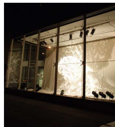
Ruth Allen 2009

The Glass Cube can be viewed at all times from the street front, not only by the 250 000 patrons that visit the FAC annually but also by passing foot and road traffic.